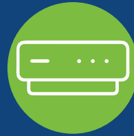
Connected Edge computer