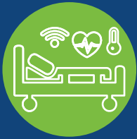
Smart Hospital Bed

Designed for Healthcare and Industrial Automation.