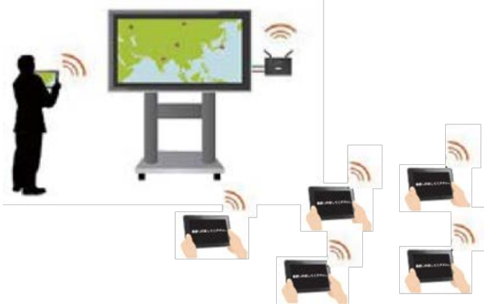
Real time wireless interactive collaboration between teacher and student including touch input and display.