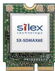
SX-SDMAX6E-M2 (M.2 Connector Type)